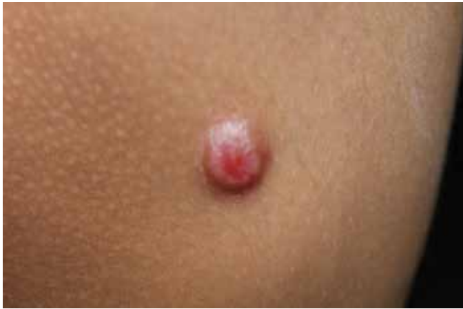
Figure 1. A 10 years-old male patient presented to our outpatient clinic because of a painless mass for 2 months on the right knee. There was no comorbidity in his history. Dermatological examination revealed a 2x2 cm erythematous nodule in the medial region of the right knee.

Keywords: Nodule, immunohistochemistry, storiform