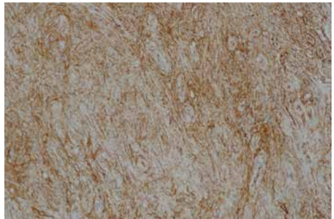
Figure 2c. Immunohistochemical examination revealed CD34 (+), S100 (-), Ki 67 (-), HHV8 (-). Based on these findings, the patient was diagnosed with dermatofibrosarcoma protuberans (DFSP) (x20).

DFSP is an uncommon soft tissue tumor that involves the dermis, subcutaneous fat, and, in rare cases, muscle and fascia. Diagnosis is made via skin biopsy (1). Tumors occur most often in adults in the third to fifth decades of life but have rarely been reported in the pediatric population. The prevalence of DFSP before 20 years of age is 1.0 per million (2).